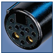
NEW 10 pole cable connector