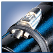
Ergonomic latch design